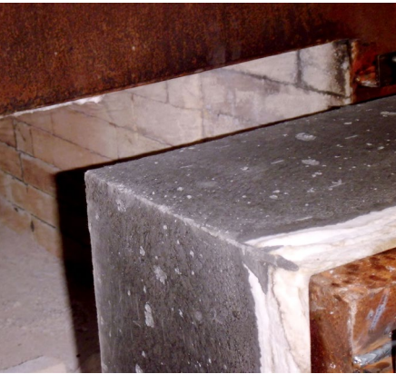
Placement of the castable block, dimensions 500 x 500 x 250 mm in the test furnace.