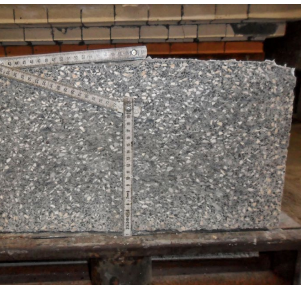
Picture of the cut through the castable structure of JuFAST HP000Q after heating with a linear temperature increase of 100 K/h. Result: No noticeable cracks in the structure.